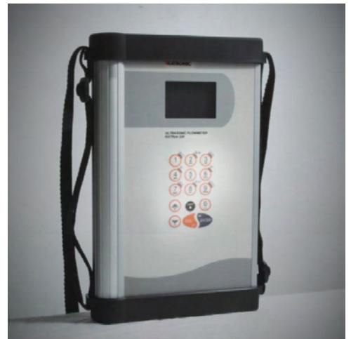
KATflow 230 portable flowmeter.

Volumetric flow rate: m 3 /h, m 3 /min, m 3 /s, l/h, l/min, l/s, USgal/h (US gallons per hour), USgal/min, USgal/s, bbl/d (barrels per day), bbl/h, bbl/min, bbl/s Flow velocity: m/s, ft/s, inch/s Mass flow rate: g/s, t/h, kg/h, kg/min Volume: m 3 , l, gal (US gallons), bbl Mass: g, kg, t Heat flow: W, kW, MW (only with heat quantity measurement option on KATflow 230 and 150) Heat quantity: J, kJ, MJ (only with heat quantity measurement option on KATflow 230 and 150)