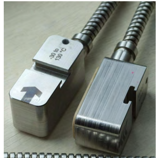
Ultrasonic flow sensors with stainless steel head casing and cable conduit for extreme robustness. There are two sensor types available to cover a diameter range from 10 mm to 3 m.

The KATflow series of ultrasonic clamp-on flowmeters can cover a pipe diameter range from 10 mm (0.4 inches) to 3 m (118 inches) with special solutions available for non-standard applications.