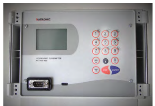
KATflow 150 fixed installation flowmeter.