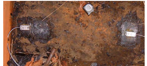
Ultrasonic flow sensors mounted on a main water line of Thames Water. After the installation the sensors were buried.

All of Katronic's ultrasonic clamp-on sensors have a minimum ingress protection rating of IP66. This means that they are suitable for installation on buried pipes, in open areas where they are subject to rain, and in plants where there is spray cleaning. There is also the option to upgrade the sensors to IP68 for permanent immersion in water.