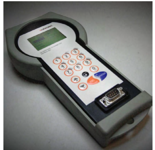
KATflow 200 hand-held flowmeter.

If additional accuracy is required, a process calibration can be carried out on site.