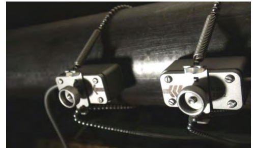
Ultrasonic flow sensors strapped on the pipe surface using chains and clips. The clamp-on mounting technique allows flow to be measured on pipes of various diameters without the need to cut into the pipes.

In order to achieve a good signal strength and high accuracy, the mounting points on rough pipes may need to be ground before the installation of the sensors. Every instrument of the KATflow series is equipped with a set-up wizard and sensor positioning assistant, which guide the user step-by-step through the installation process. As a result, it only takes minutes to install and set up the flowmeter and to obtain correct measurement data.